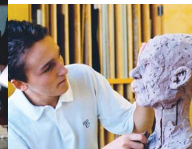
Visual Arts, Drama, Dance and Music specialty programs in The Regional Arts Program at St. Elizabeth Catholic High School.