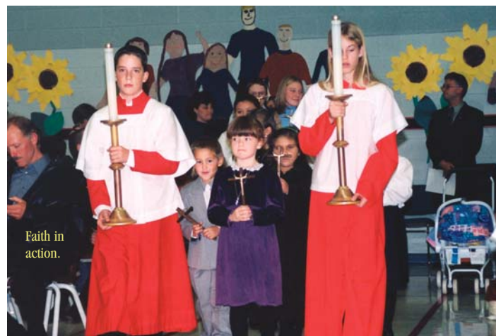
Faith in action.