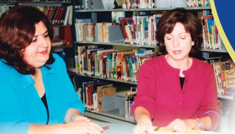
Model classrooms where teachers share best practices.