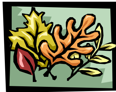
Lord, you alone can heal and restore us...