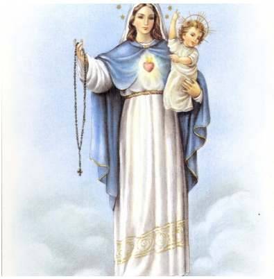
Our Lady of the Rosary