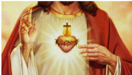
SACRED HEART OF JESUS